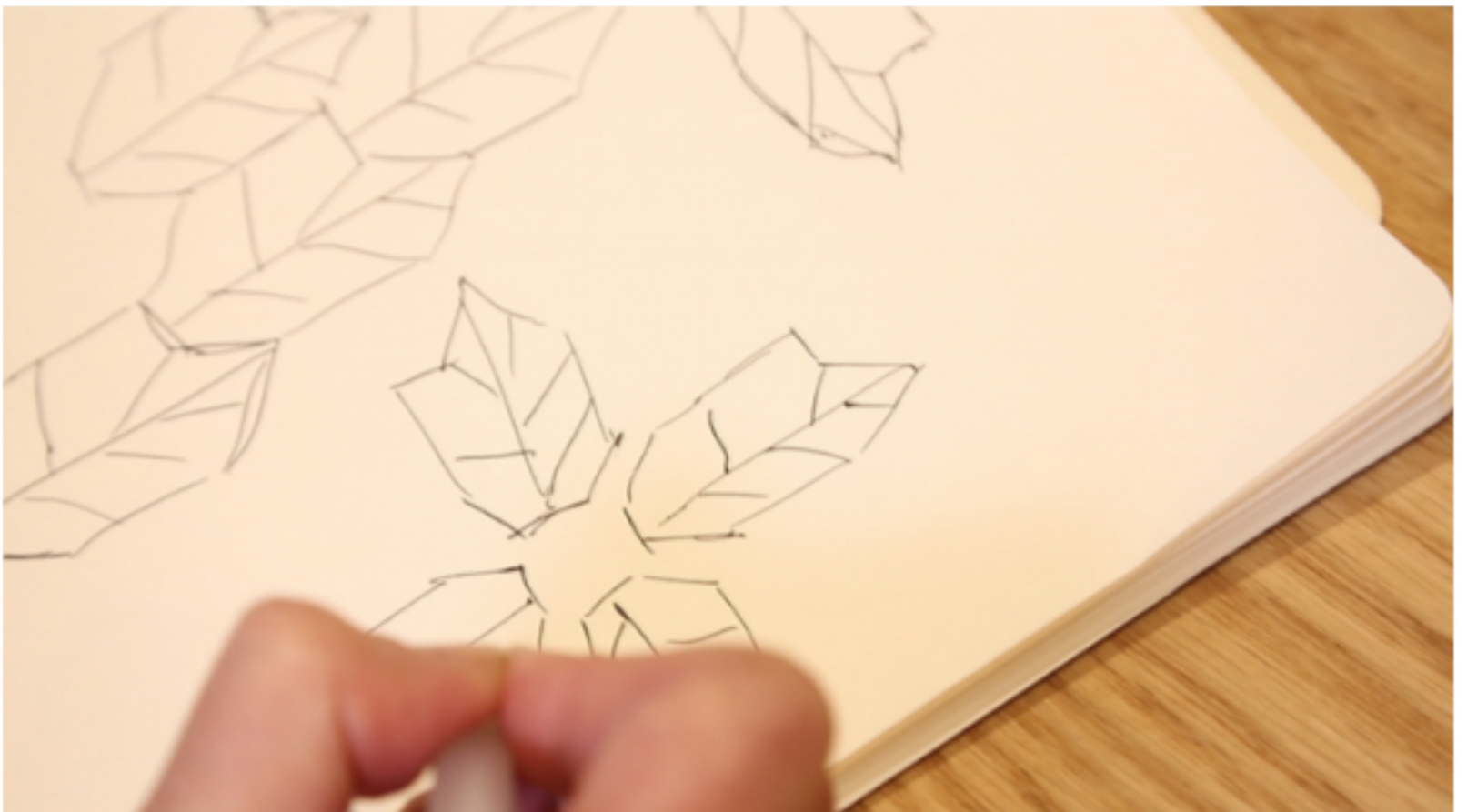
Nicolette showing us the many possible configurations that can be achieved with the Leaf seat