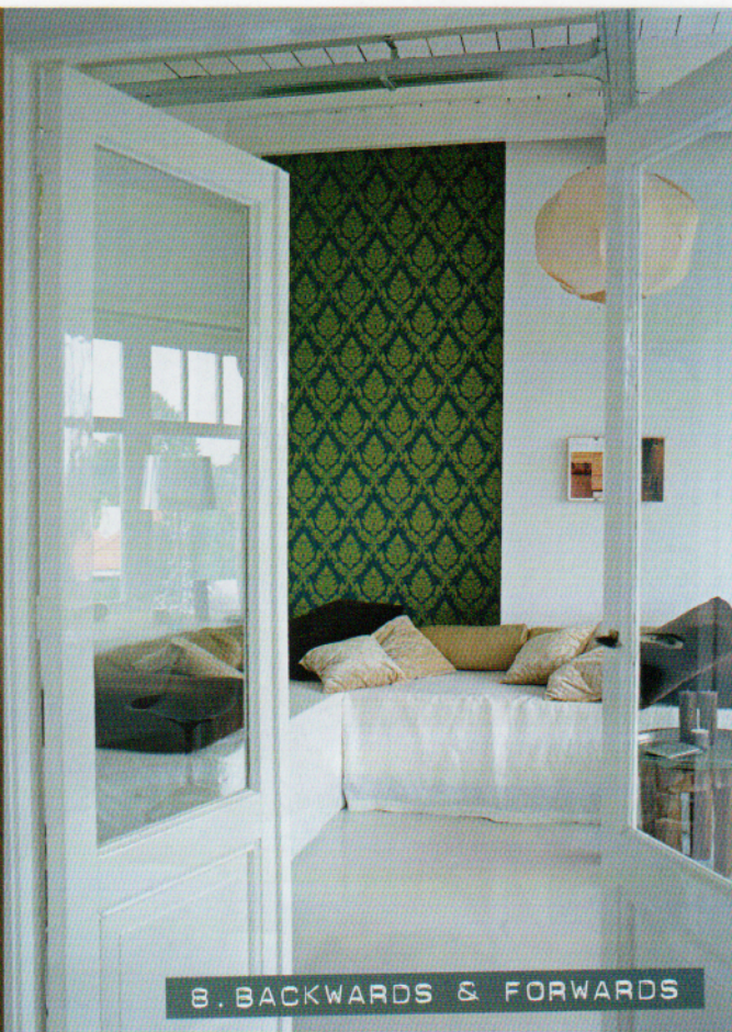
8. BACKWARDS &amp; FORWARDS

Finesse your improvisation skills and effective and practical design solutions will follow. Here, the owners took up the book-storage challenge by utilising free floor space. The Bertioia wire chair is another inspired choice, giving the illusion of invisibility and, therefore, seeming to take up less space. Other see-through options include furniture made from glass or heavy-duty plastic (try visiting www.spacefurniture.com.au to check out the fun and edgy range from celebrated Italian design house Kartell). →