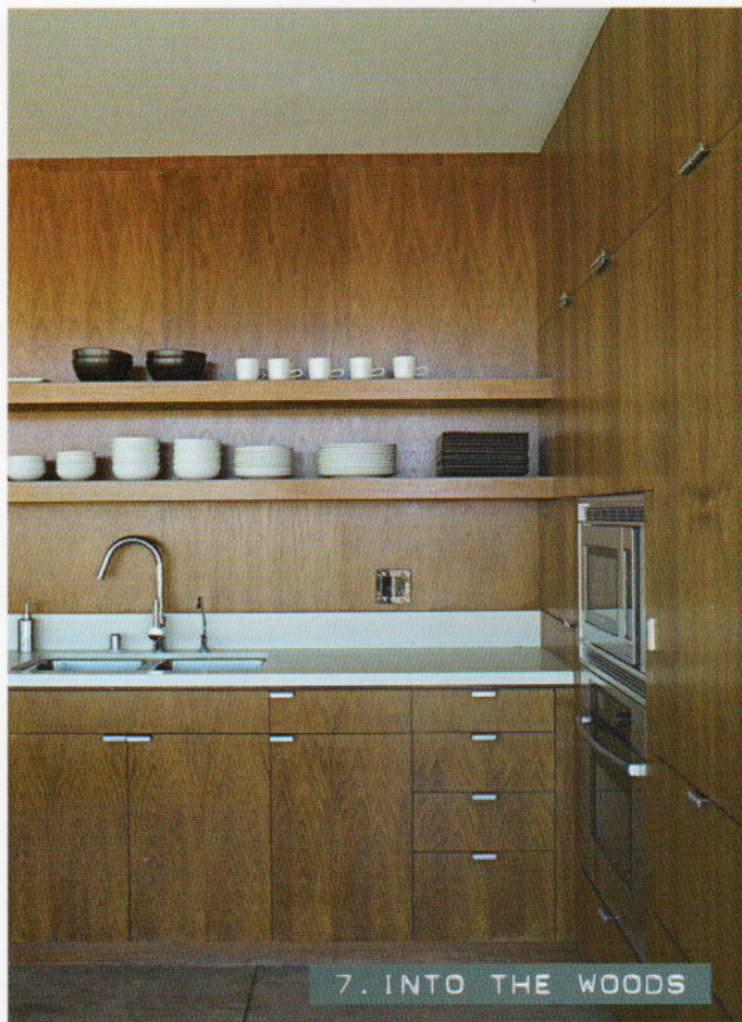
7. INTO THE WOODS