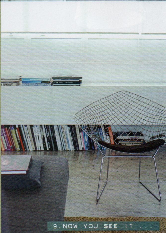
9. NOW YOU SEE IT ...