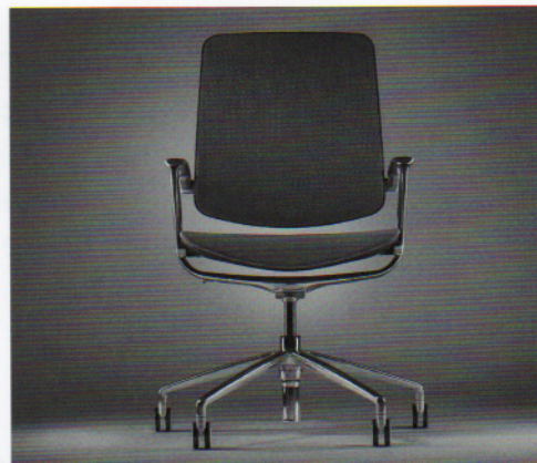
Trinetec designed and distributed by Boss Design ↓