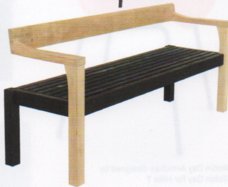
Floating Bench designed by Simon Pirie for Sitting Spiritually Ltd ↑