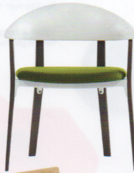
"Curve Chair" (Zones Collection) Designed by Pearson Lloyd for Teknion ↙