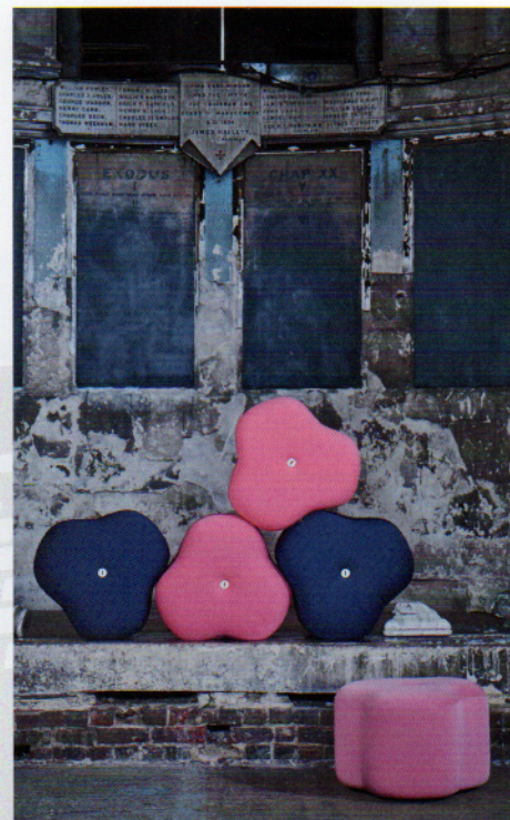
↑ Poppy Bloom Stool